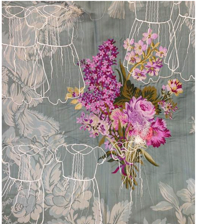
Bordados y Desbordados